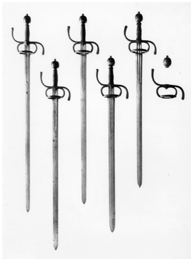
Rapiers made for the Squires of Gustaf Adolf II. 6

At the Livrustkammaren Stockholm, the Royal Swedish Armoury,