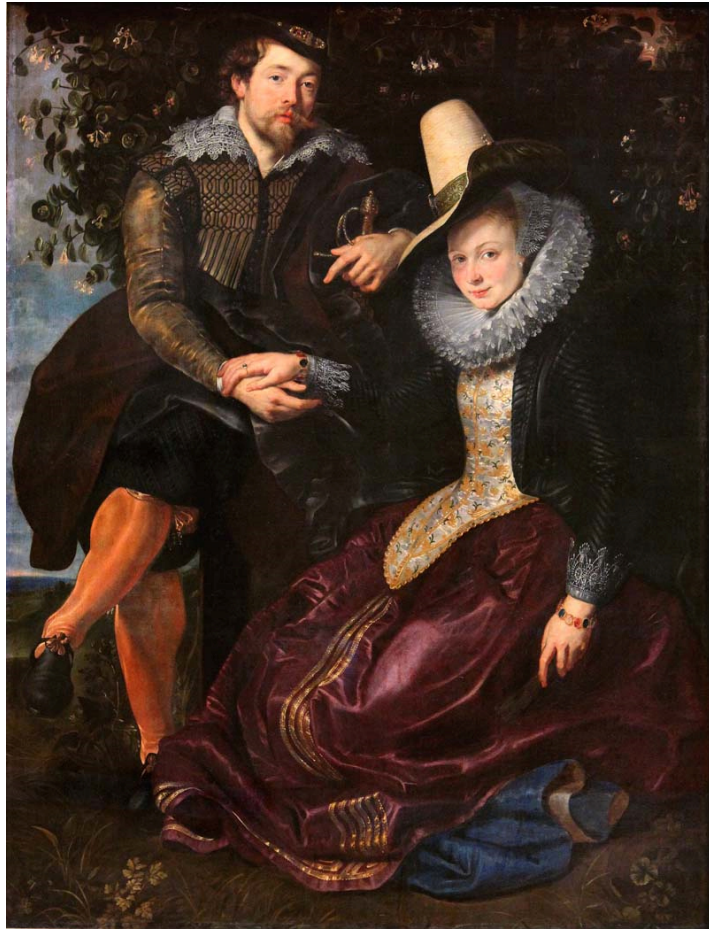
Peter Paul Rubens, 1650. 10