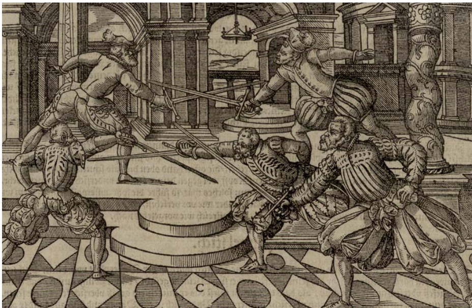
Scenes from a fencing school, illustrated manual by Joachim Meyer. 7

The more the evolution of the rapier went forward, the more varieties of blades and hilts were manufactured in the course of time. This process depended closely on the development of fencing techniques.