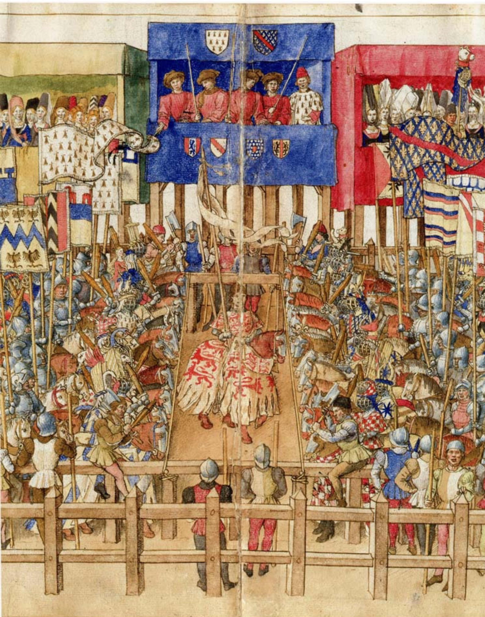
D'Eyck, B. (ca. 1460): Le Livre des Tournois de René d'Anjou.