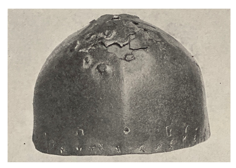
Fig. 8. Cervelliere, 15th century.8