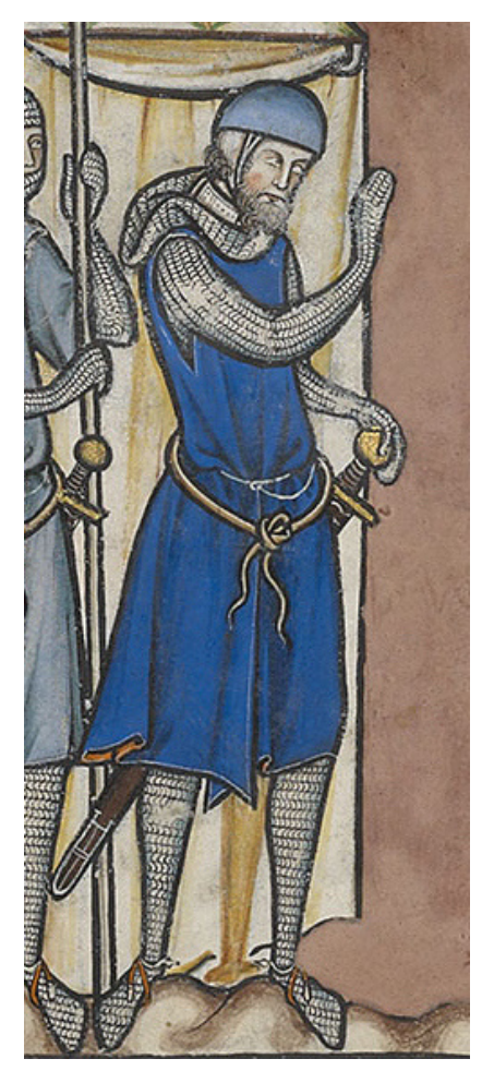
Fig. 4 Warrior. <sup>3</sup>

picture Bible, dating from circa 1250. There are depictions that show the cervelliere worn below a coif as on fig. 4.