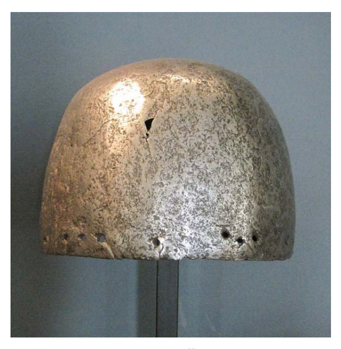
Fig. 6. Cervelliere.<sup>5</sup>

This helmet is obviously a ground found. Unfortunately, it has been heavily cleaned.