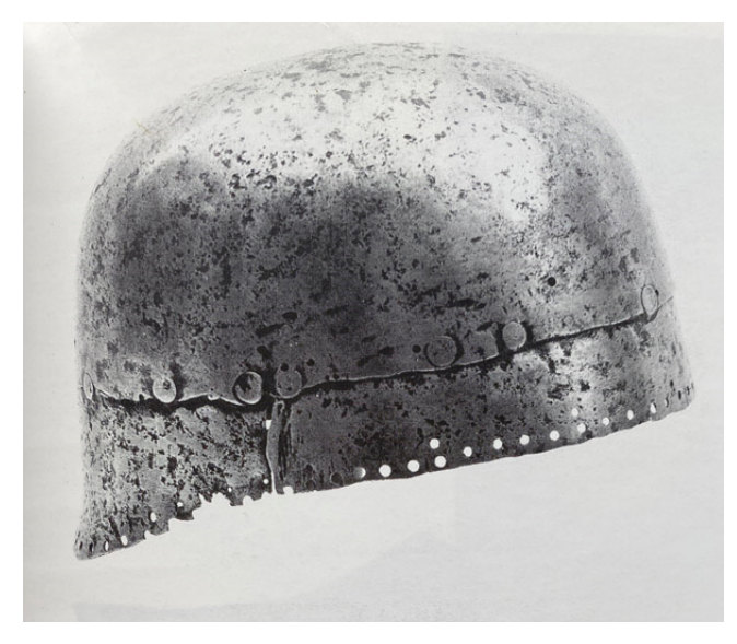
Fig. 7. Cervelliere, early sallet<sup>6</sup>

This piece is very interesting, as it illustrates how items were reused during their lifetime. By riveting additional plates to the cervelliere it was changed to an early sallet, possibly at circa 1350 to 1400. Also, this helmet is an excavation and has been heavily overcleaned, as it was common practice in the 19th and early 20th century. Today there would be advanced conservational methods in order to preserve its patina.