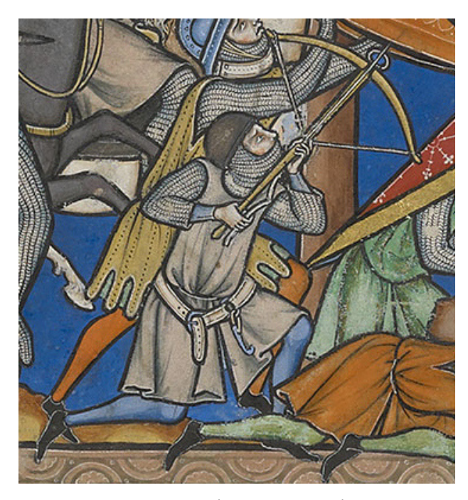
Fig. 5. Warrior shooting a crossbow.<sup>4</sup>

Last but not least, the cervelliere was also worn beneath the great helmet by knights on horseback.