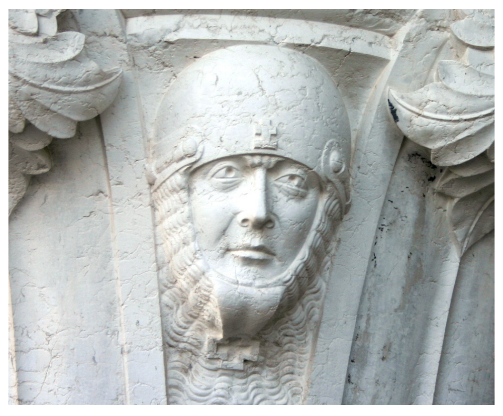
Fig. 3. Carved Capital at the Doge's Palace, Venice, circa 1309.

An interesting feature is the cross shaped hook on the forehead. This corresponds to an eye on the end of an extension of the aventail near the chin. Hanging this into the hook would provide for an additional protection in a combat situation, a feature found on other depictions as well, but not always.