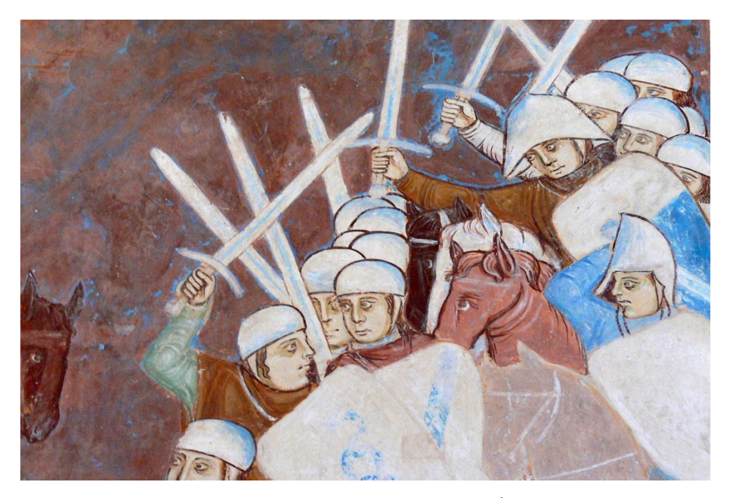
Fig. 1 Fresco, Italy, early 14th cent.1

distance, appearing like a pair. While one secured the lining, the other held a chin strap which was necessary to fasten the helmet to the head.